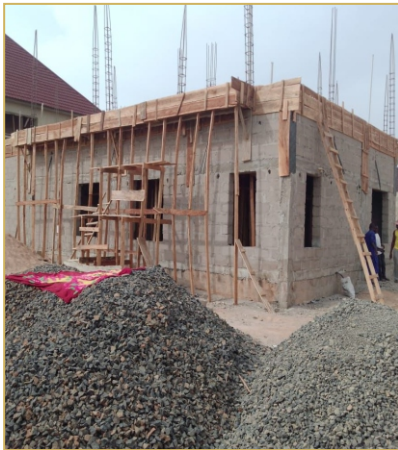
Construction of 5 bedrooms Fully Detached Duplex