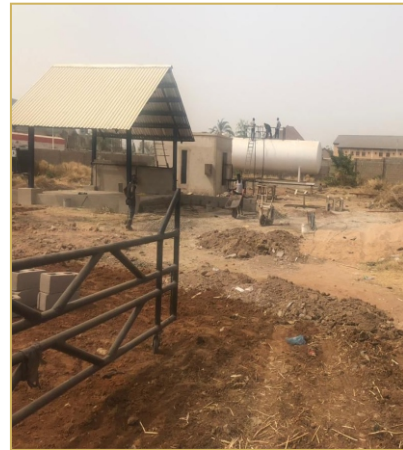
Construction of LPG Gas Plant with 40MT Capacity