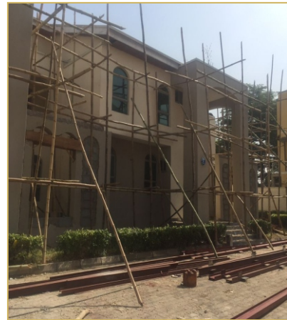
Renovation and Remodeling of 16 Units of 4bedrooms semi detached duplex, Abuja