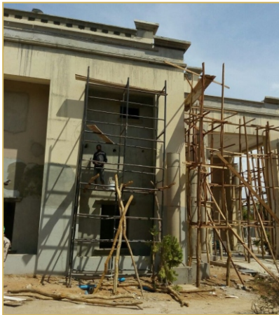
Construction of 9bedrooms Mansion